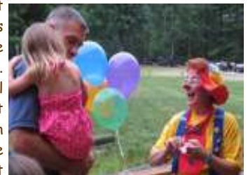
One of the clowns from Granite State Clowns entertains a young carnival goer

Mark your calendars, Friday July 17th at 6pm is the seventh annual family carnival. Dinner, concession food and carnival games/activities will take place for a minimal fee. ALL proceeds to benefit the YMCA of Greater Nashua's Strong Kids Campaign which provides financial assistance to those in our community who need it most. Last year, Carnival was a little soggy but all the families who came out enjoyed great food, terrific entertainment (right) and even free ice cream samples from Brusters ice cream, thanks Brusters! Join us for a great time and help support a wonderful cause. We'll see ya there!