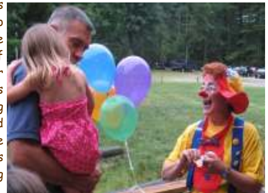
One of the clowns from Granite State Clowns entertains a young carnival goer

July 25th was the 6th annual Family Carnival & golf ball drop. Wet weather leading up to the event had many worried that it would not take place. As it neared the start time of 6:30pm the skies cleared up and were rain free! Many passerby's who drove down Camp Sargent Road stopped to see what was going on. Those who did attend the event were treated to delicious free samples of ice cream courtesy of Bruster's Ice Cream. Some other vendors at the event who volunteered their time for the evening were the Granite State Clowns (www.granitestateclowns.com), Merrimack Fire Department and The Dowg Shack of Merrimack for supplying dinner! Normally the Carnival and fundraiser golf ball drop take place the same night. Due to the incimate weather and chance of severe weather, the golf ball drop was postponed to the following week during the camp day. There were some big money winners, but nobody went home with the big $25,000 prize. Thanks to all who attended the event, the staff who worked it, and the vendors who participated and helped make the evening special despite the weather.