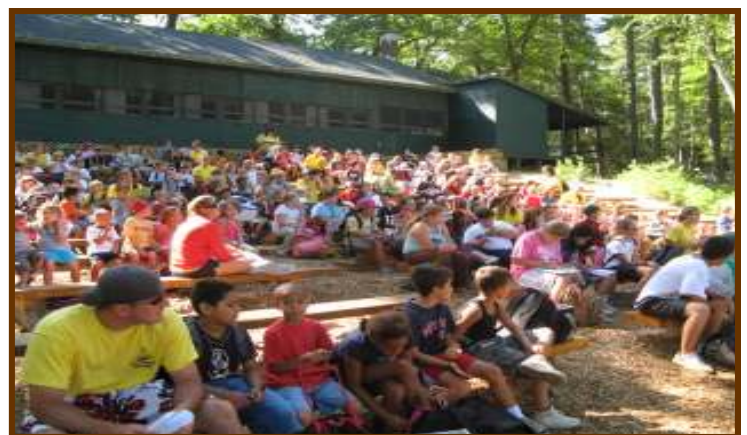
Staff and campers listening to morning announcements at the brand new amphitheatre

This fall we will be mailing home surveys to ALL parents of campers. The purpose of this survey is to directly ask the question to campers and their parents, "What are we doing right, wrong and how can we improve"? I feel this is crucial to the continued successes of camp. Without listening to what our campers and their parents are telling us, camp would not be able to improve and grow into a safe and more enjoyable place to be. The surveys will be evaluated and notes will be made on common remarks whether good or bad. This is something taken very seriously and I always look forward to getting direct feedback after each summer to assist improving the next.