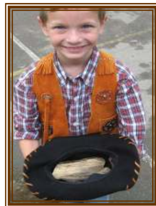
A young cowboy shows off his gold while on line at the bank