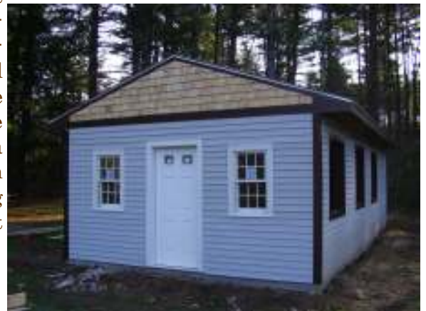
A new Arts and Crafts Cabin (above) and adjacent pavilion are among the additions to Camp Sargent for the 2008 season.